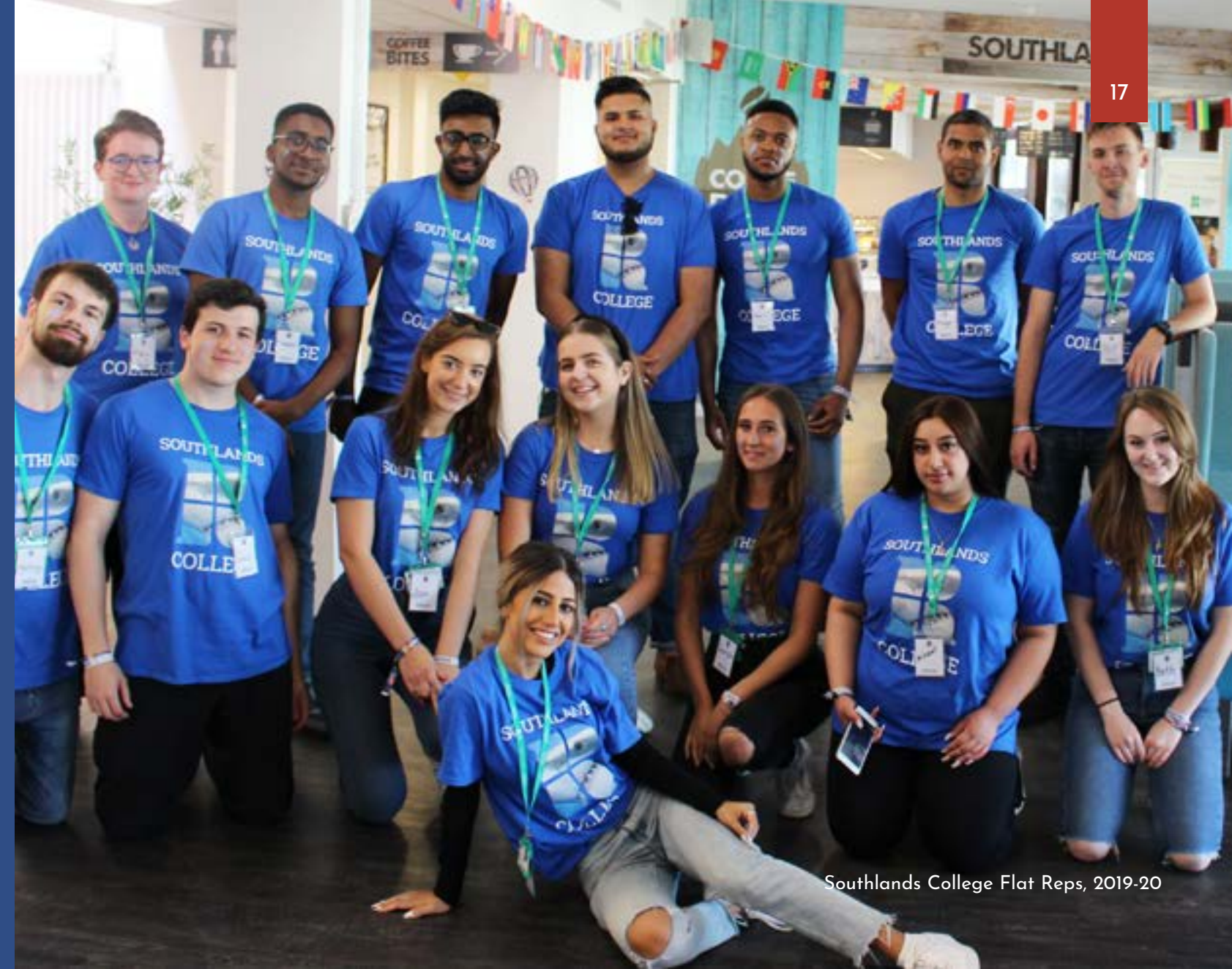
Southlands College Flat Reps, 2019-20