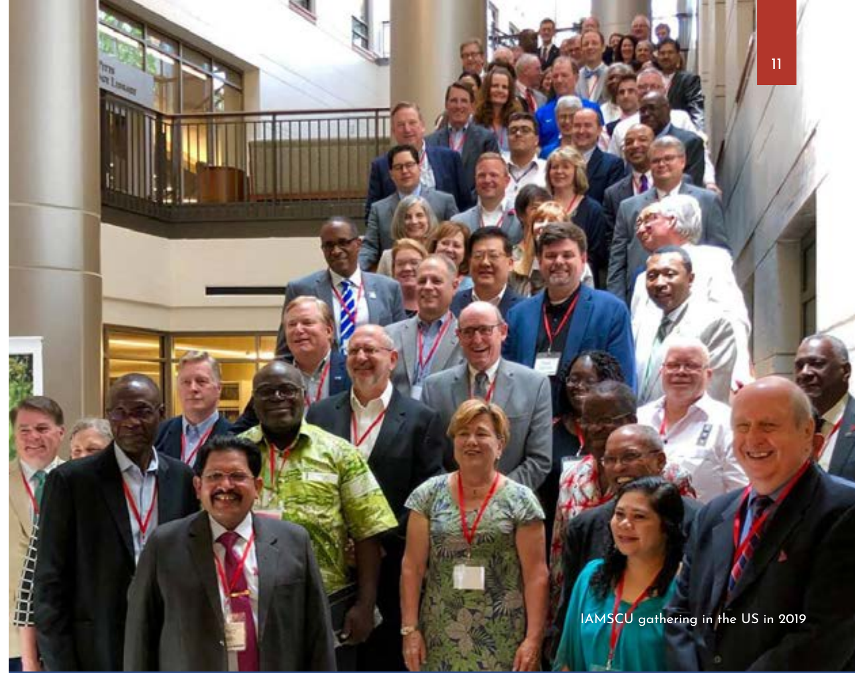
IAMSCU gathering in the US in 2019