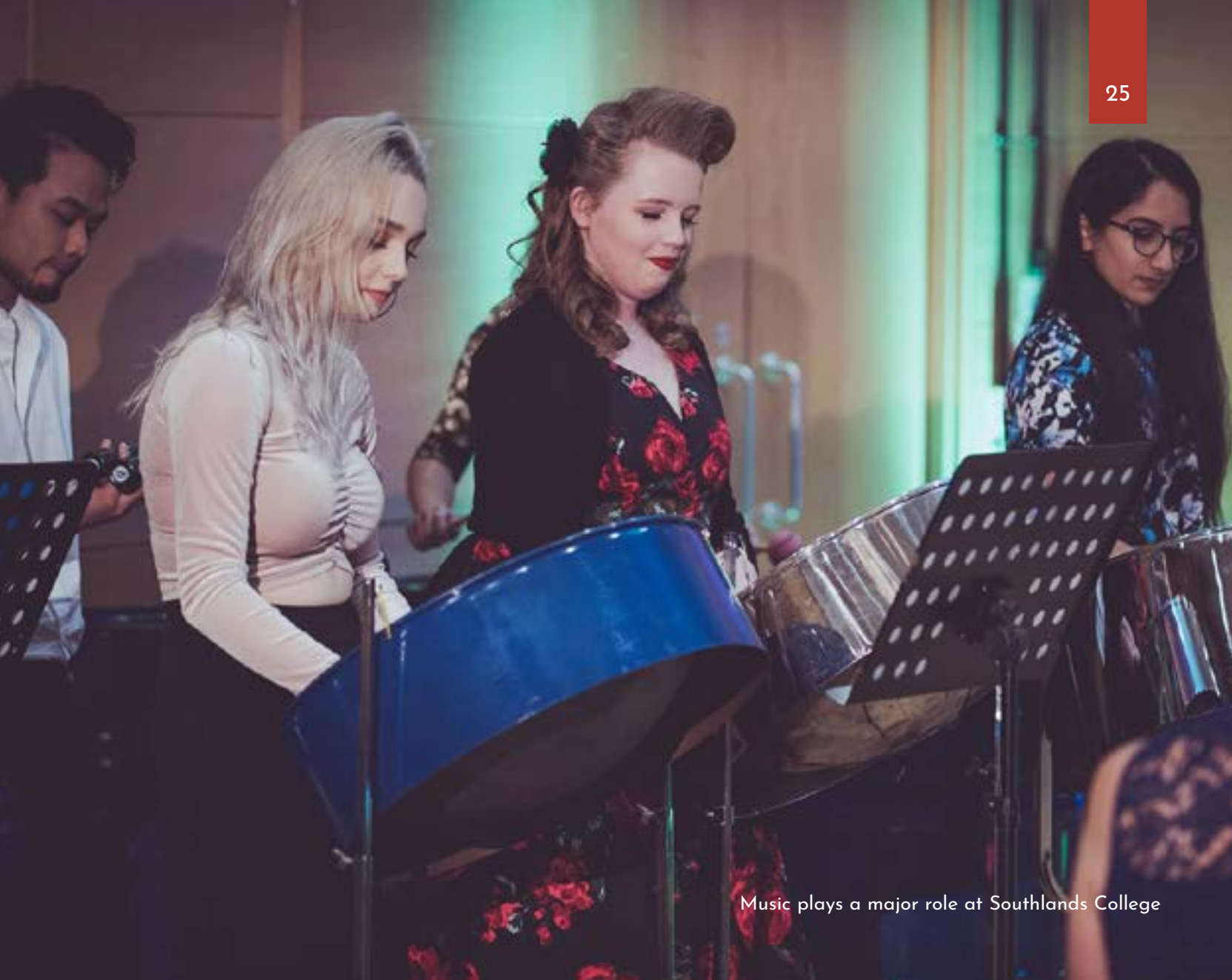
Music plays a major role at Southlands College