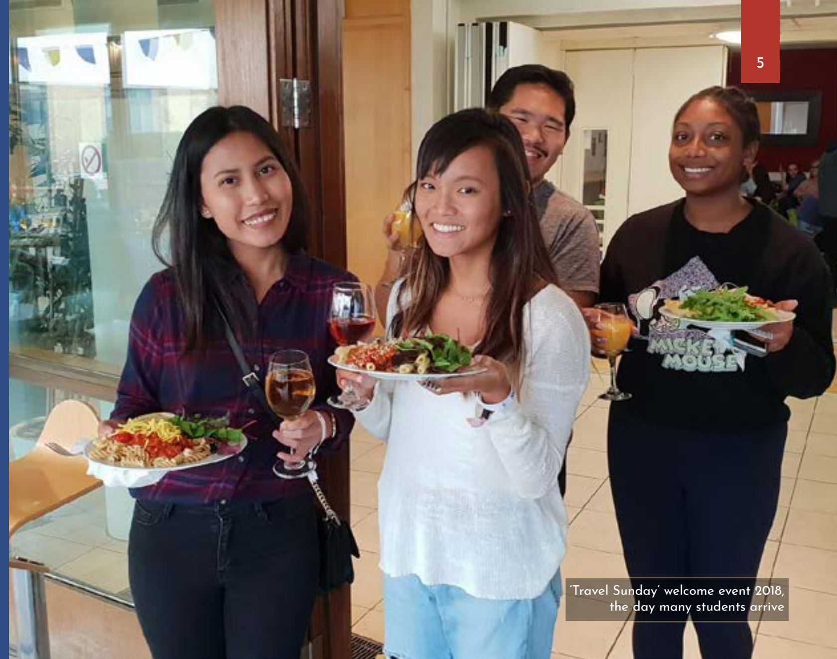
'Travel Sunday' welcome event 2018, the day many students arrive

The Christian foundations of the colleges have also influenced the research and learning which takes place at Roehampton. In the context of popular taught and research degree programmes in Theology and Religious Studies, and Ministerial Theology, and working alongside the Digby Stuart Centre for Catholic Studies, the Susanna Wesley Foundation is a Methodist research centre based at Southlands College which explores critical questions about church organisation of importance to the Methodist Church and its ecumenical partners.