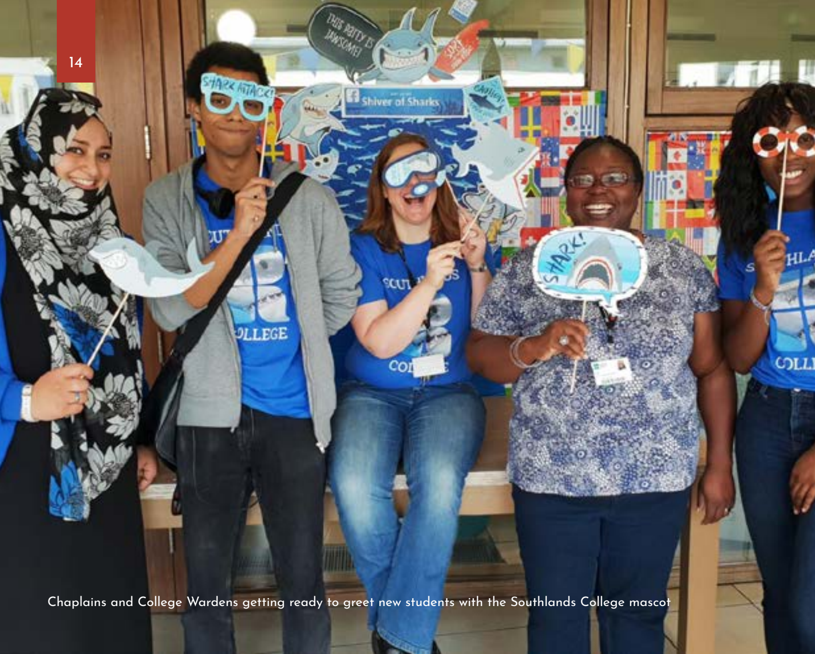
Chaplains and College Wardens getting ready to greet new students with the Southlands College mascot