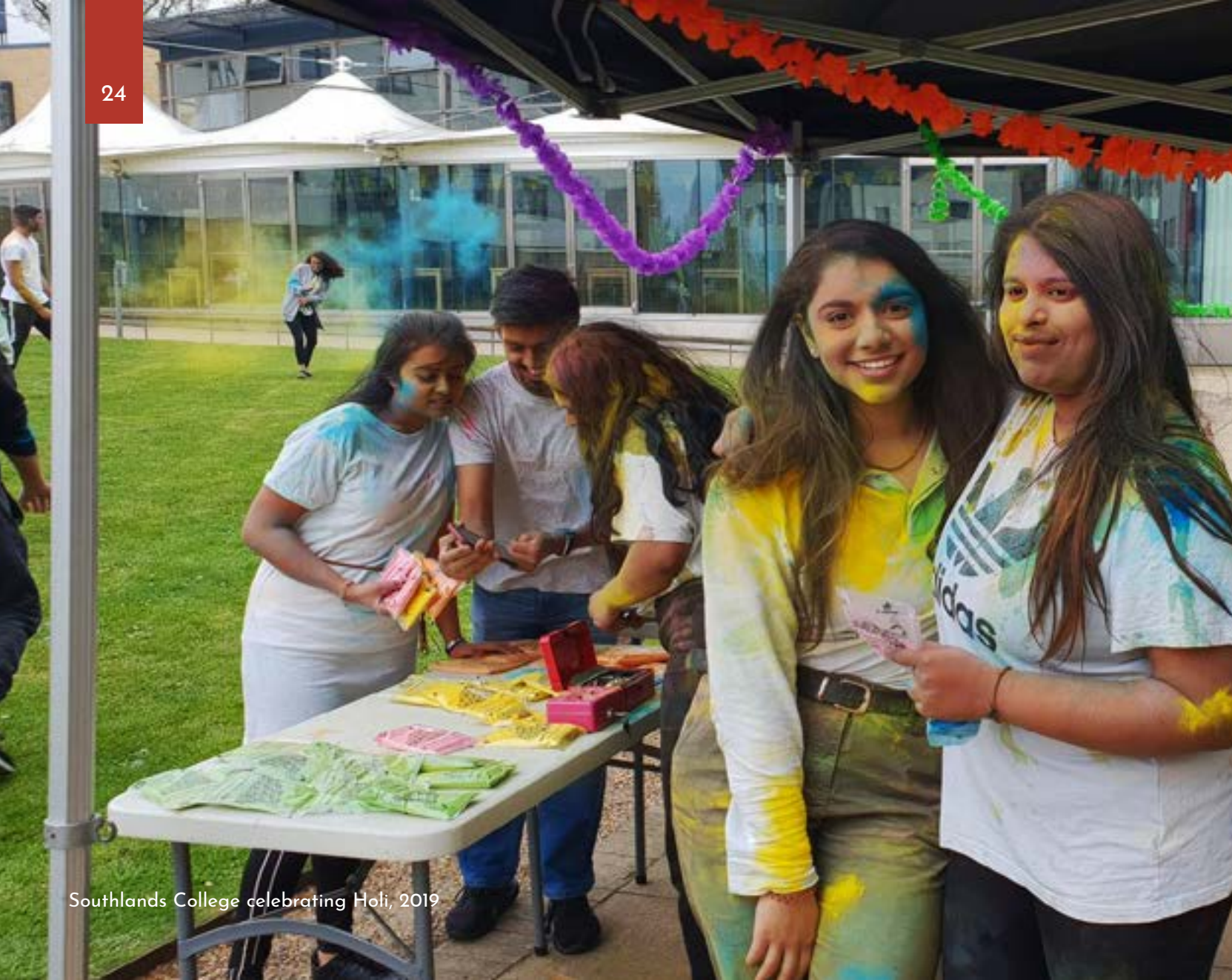
Southlands College celebrating Holi, 2019