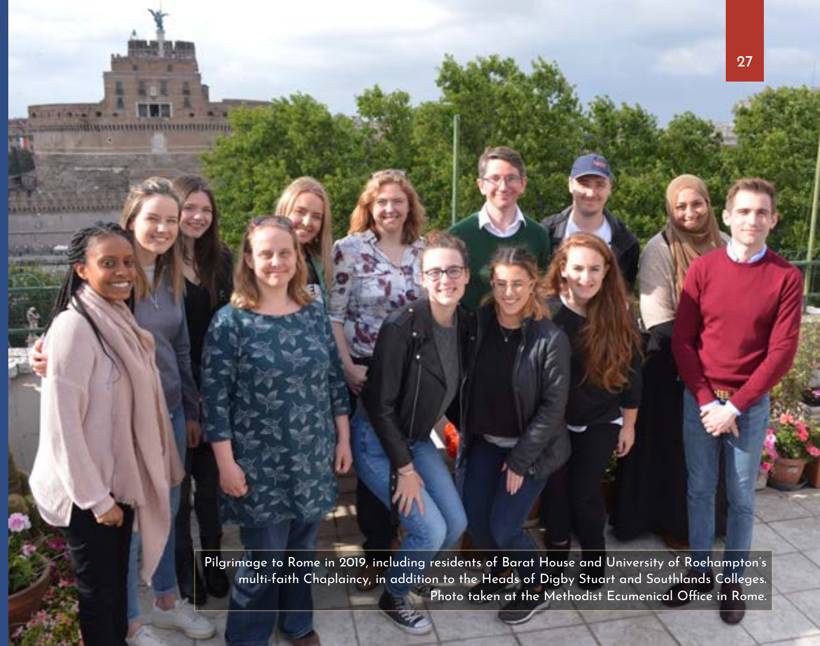
Pilgrimage to Rome in 2019, including residents of Barat House and University of Roehampton's multi-faith Chaplaincy, in addition to the Heads of Digby Stuart and Southlands Colleges. Photo taken at the Methodist Ecumenical Office in Rome.