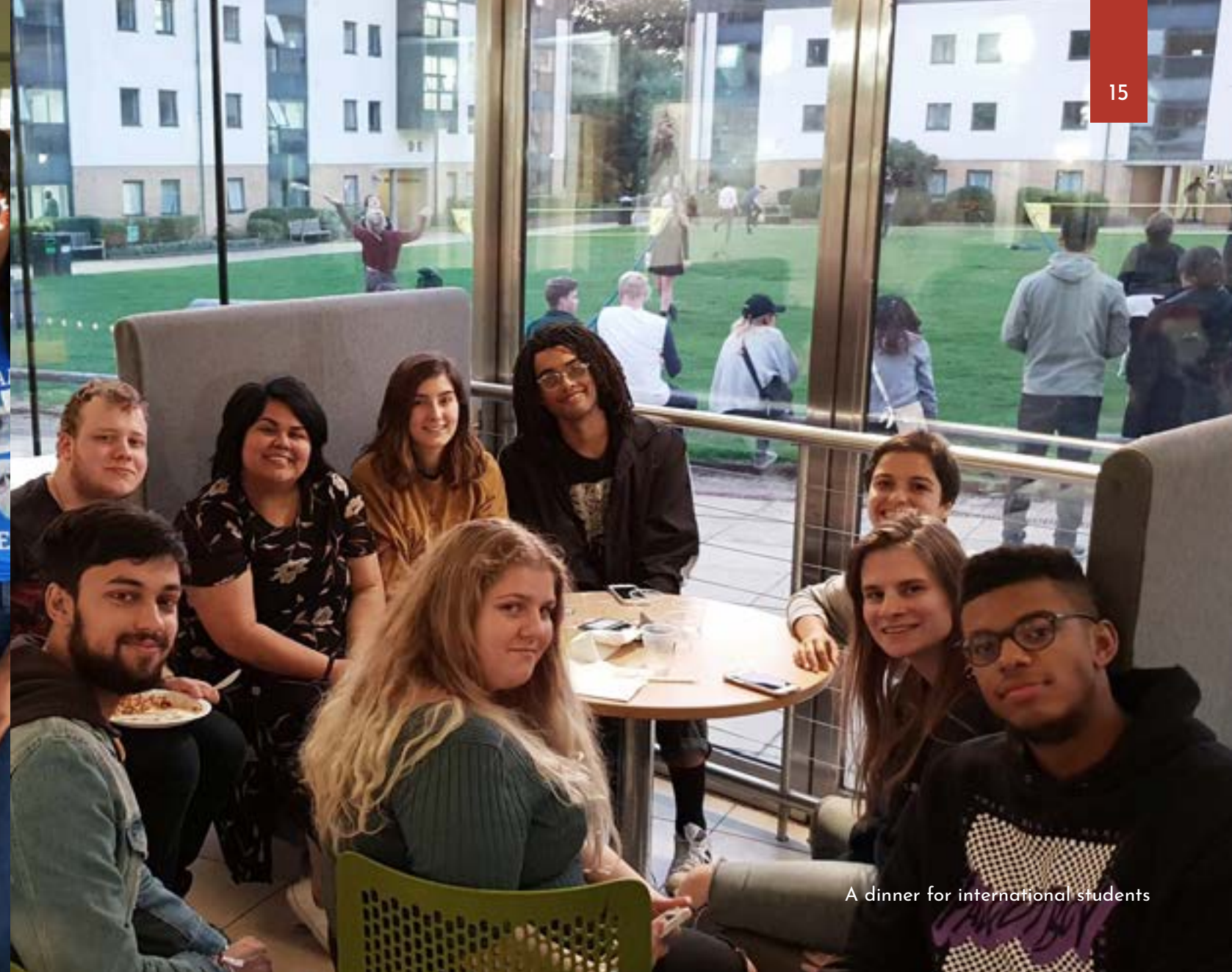
A dinner for international students